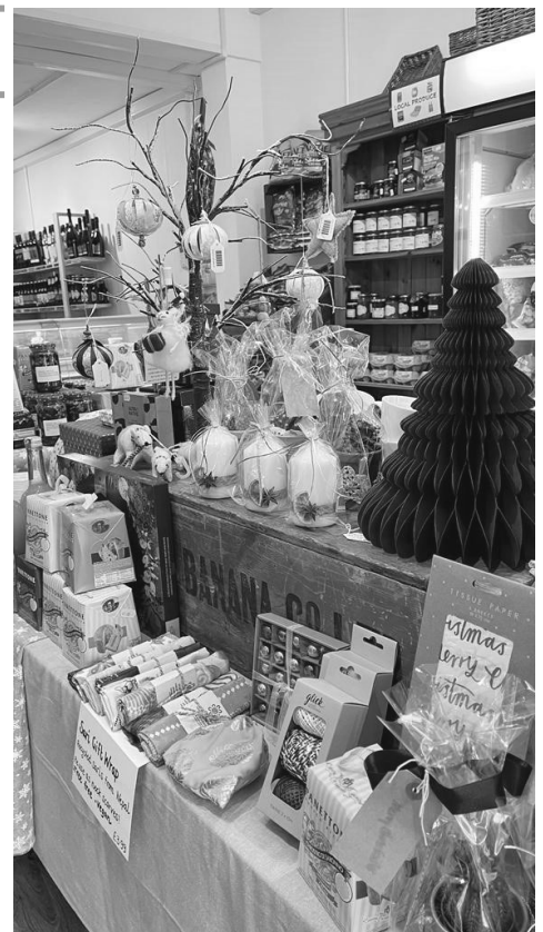
Candles, gift wrap and more

There's still time to order your Christmas meat which will be ready to collect on Christmas Eve, as well as any bread or other bakery items you would like for the holiday.