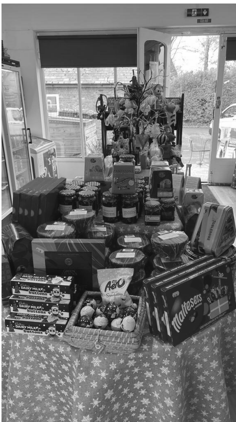
Puddings, mincemeat and chocolates

monitor for sale. It's worth around £150 but please make us a decent offer and it's yours.